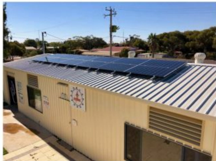
Above: Newly installed Solar System at Pool

In accordance with the current years Budget, a 7.5kw Solar system was recently installed at the Pool machinery shed to try to reduce the Western Power invoices during the Pool season. It may be of interest to some that the average power consumption at the Pool during the pool season is around $115.00 per day or $800 per week. Whilst the solar system installed will not reduce the electricity costs considerably, given the very high consumption of running the pumps, we are hoping for a reduction of around 15% during the season which will equate to around $3000.00 per year in savings.