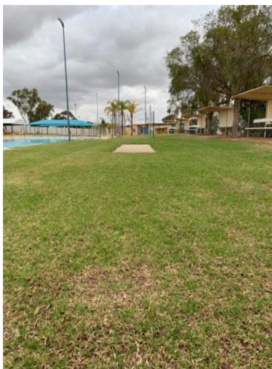
Above: dethatched lawn