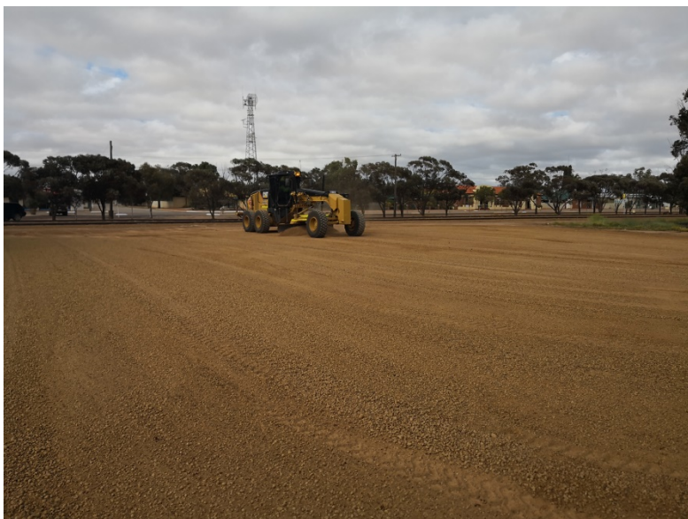
Hardstand construction for Men's Shed