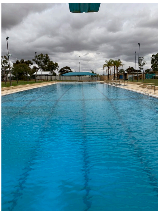
Above: preparing for opening