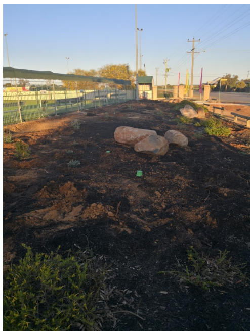
Garden bed at entry to Sports Complex