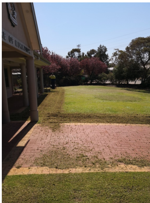
Administration Office lawn verti-mowing