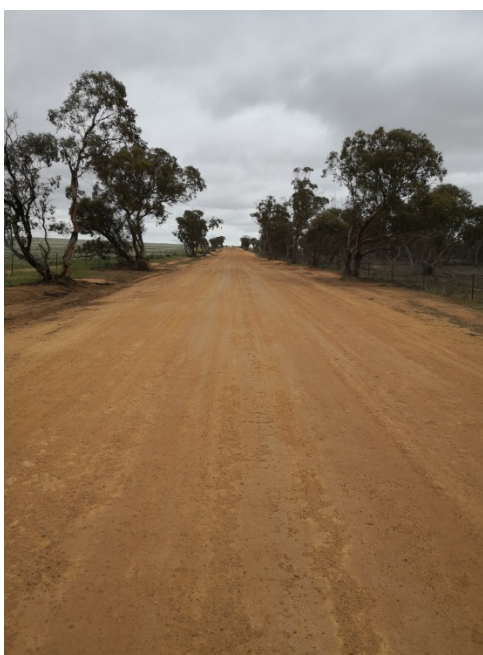
Road Works – McGregor Road