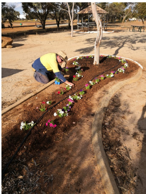
Potted colour planted at western entry to town