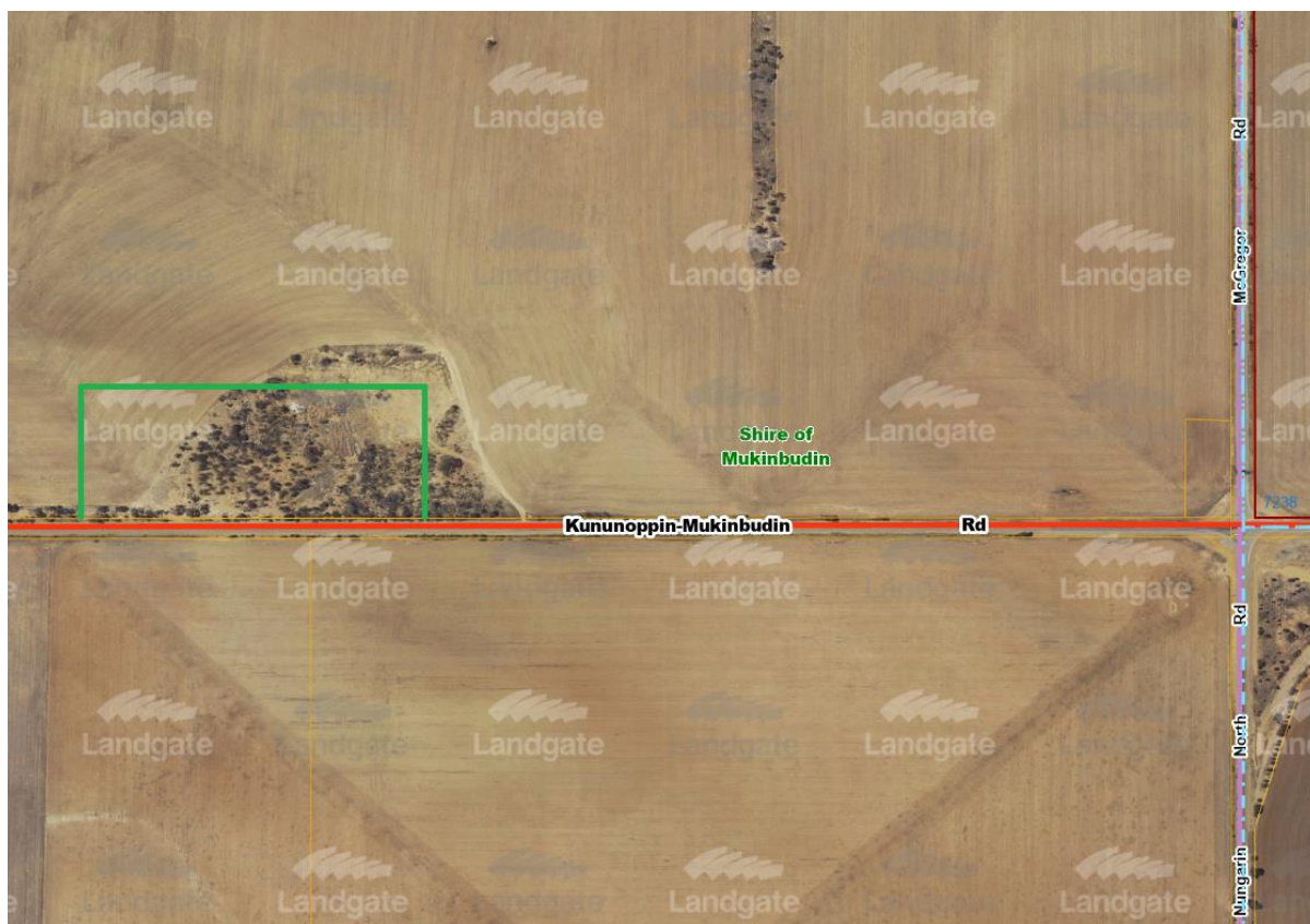
Above: Aerial photo of Gravel supply – photo taken circa 2021

Mukinbudin Townsite. During this time the remaining useful gravel within the Reserve was exhausted and this reserve is now considered of no use or benefit to the Shire of Mukinbudin.