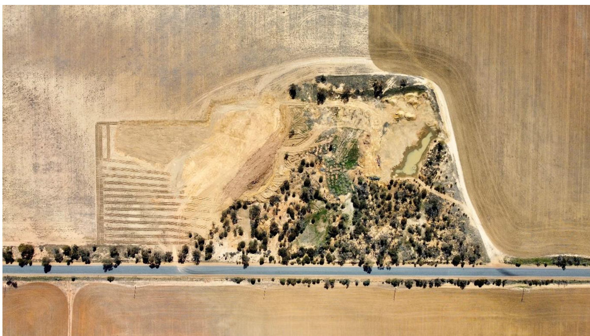
Above: Aerial photo of Gravel supply taken 19 th May 2023