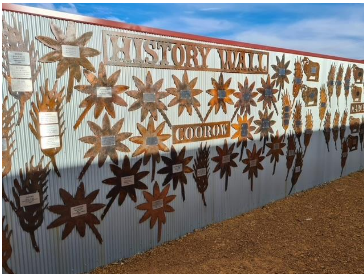
Above: An example of a history wall recently completed in Coorow.