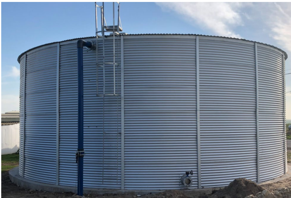
Above: 360,000ltr metal tank.