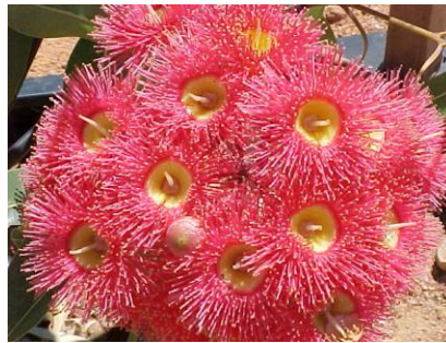
Floral Emblem Eucalyptus erythronema (Red Flowering Mallee)